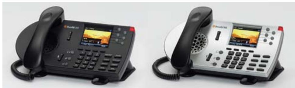
Figure 5: ShoreTel IP phones are designed to be aesthetically pleasing. They come in black or silver to match your office style, and are available with color screens for elegance and clarity.

The phone base has a gentle concave sweep, which places the keypad somewhat horizontally for ease of dialing—like a laptop—while the display remains on a vertical angle so it's easier to see. Workplace studies show that people find it easier to read displays when they are placed lower and angled upward toward their faces, just like reading the morning newspaper. The ShorePhone resolves the classic conflict of traditional desk phones, which seldom allow users to see the display and use the keypad at the same time. With the ShorePhones, both are visible, so users don't have to fiddle with a swiveling display while dialing.