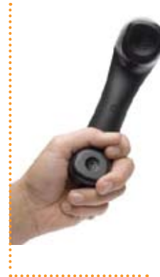
Figure 10: The mouthpiece has rounded corners so a user may comfortably hold the handset around the mouthpiece.