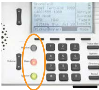
Figure 6: It's easy to switch between a handset, headset and speaker. Plus, bright indicator lights make it easy to see if a person is on the phone.

The phone base has a gentle concave sweep, which places the keypad somewhat horizontally for ease of dialing—like a laptop—while the display remains on a vertical angle so it's easier to see. Workplace studies show that people find it easier to read displays when they are placed lower and angled upward toward their faces, just like reading the morning newspaper. The ShorePhone resolves the classic conflict of traditional desk phones, which seldom allow users to see the display and use the keypad at the same time. With the ShorePhones, both are visible, so users don't have to fiddle with a swiveling display while dialing.