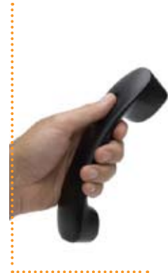
Figure 11: A user may hold a handset with a thumb on the back, using the finger notch.