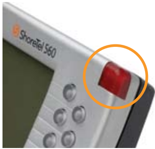
Figure 7: A large, bright message waiting light makes it easy to see if a message is waiting even if the phone is turned away from the user.

The display on the ShorePhone is large and easy to see, which is particularly important as the average age of the workforce increases. In addition, the message-waiting light is large and bright, and visible from 360 degrees because it's located at the top right corner of the phone. A user can see if a message is waiting even if the phone is turned away, and the line buttons are color-lit so they are easy to use.