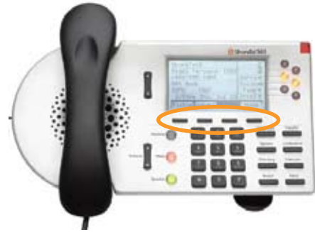
Figure 14: Soft keys provide context-sensitive operations, making the phone easy to use.