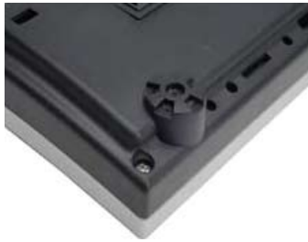
Figure 3: The phone includes a high-gain, custom-designed speakerphone microphone for loud, clear sound.

Tests throughout the industry consistently show that using wideband for speech communications results in enormous improvements in speech quality. This makes it easier to recognize the caller, reduces the number of ambiguities in the conversation and eases listener fatigue. Practically speaking, callers do not have to spell out words (“S” as in “Sam” and “a” as in “apple”) to be understood, and at the average speaking rate of 120 words per minute, the number of ambiguities is reduced to almost the same number as face-to-face speech. At 3.3 kHz bandwidth, people typically understand about 75 percent of words, which improves to more than 95 percent at 7 kHz bandwidth.