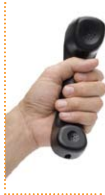
Figure 8: The handset can be held across the saddle, with the handset matching the curves of the hand.