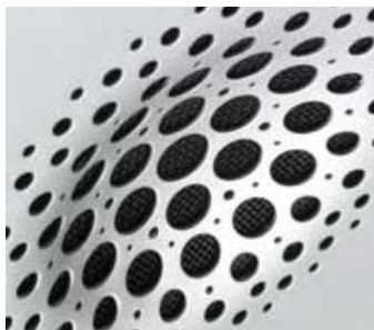
Figure 4: The speaker grill design represents the large “speaker engine” under the hood.

ShoreTel and MWM Acoustics designed the handset and speakerphone microphones, and speakers to meet ShoreTel’s requirements for hi-fidelity sound. The custom high-gain speakerphone microphone delivers outstanding sound pickup, and the speakerphone has full-duplex operation, so the audio flows continuously between both ends. Not all conventional speakerphones do this, and as a result, conversations often sound clipped. The high-volume output on the speakerphone complies with the Americans with Disabilities Act (ADA) requirements for the hearing impaired (see page 14 for full compliance details).