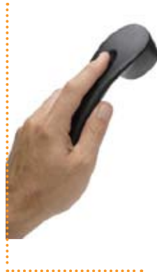
Figure 9: A user may hold the handset with an index finger on the back, so there is a finger notch.