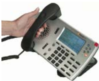
Figure 12: When you pick up the handset, you'll find the handset conforms to the shape of your hand.

It's easy to pick up a ShorePhone because there's plenty of room created by the curvature of the handset which lines up against the inverse curvature of the phone base. Sized appropriately, the handset fits neatly into the hand. Picking up a conventional bar-shaped phone can be clumsy because there isn't enough space between the handset and the base. This can result in hanging up on a caller by knocking the phone while trying to pick it up.