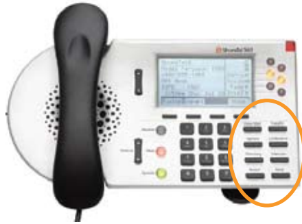
Figure 13: ShoreTel has grouped together the most common feature keys for consistent, easy access. This includes transfer, conference, intercom, hold, voicemail, options, directory and redial.